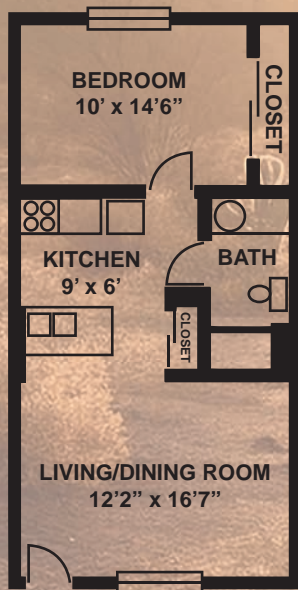
1 Bedroom/1 Bath ~ 565 Sq. Ft. ~

Single Occupancy - $1,185/Month Double Occupancy - $1,375/Month